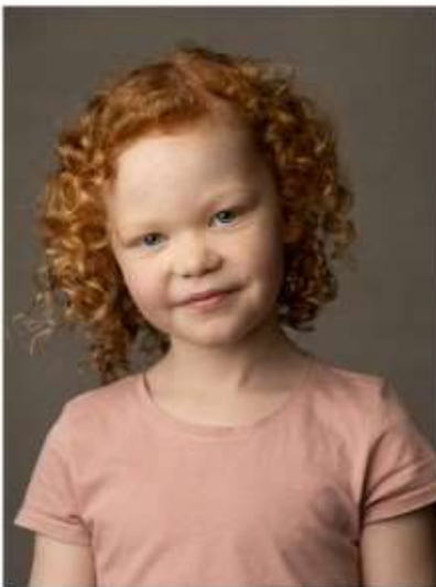
Basic headshot session