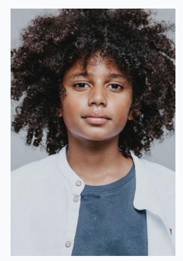
BOBE EDITORIAL DAYS: Sat 4<sup>th</sup> May - Sevenoaks, Kent

Please book on the link - \frac{\text{https://app.iris-works.com/customer/booking/98bfb00b-1546-4b5e-87e3-ae1a7bd4e51c}}{\text{ae1a7bd4e51c}}