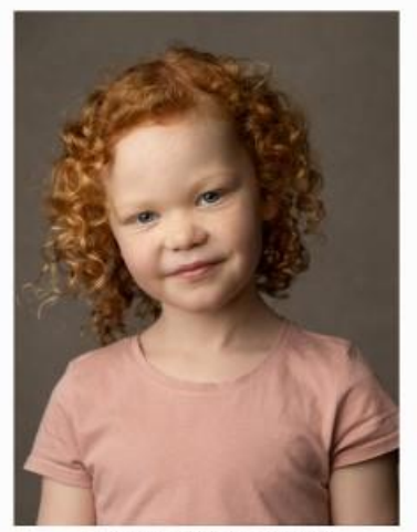
Basic headshot session